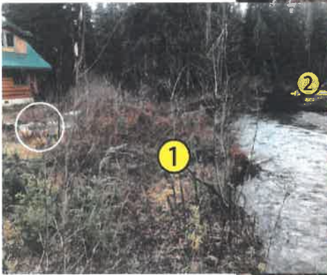
Notice where fire pit is in location to shore, 2019. Fire pit is in white circle.