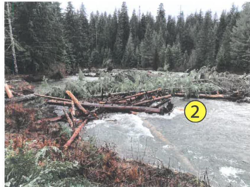
Photo of Site 2 taken in the Fall of 2021. Fallen trees due to erosion down stream created dam and increasing erosion at Site 1.