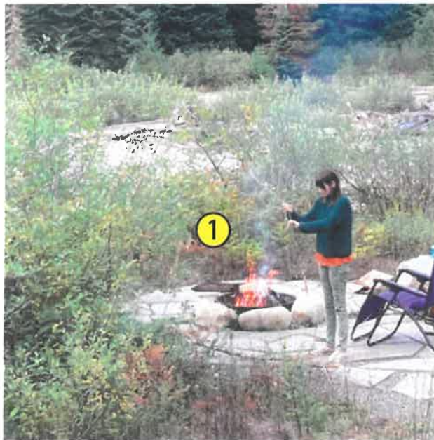
Photo of Site a taken in the fall of 2021 before the massive erosion just a few months later.