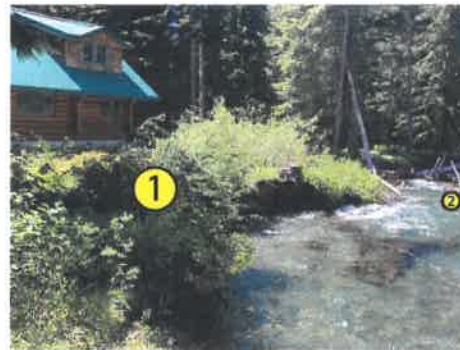
Photo from Spring of 2022 showing proximity of cabin to Site 1 and Site 2.